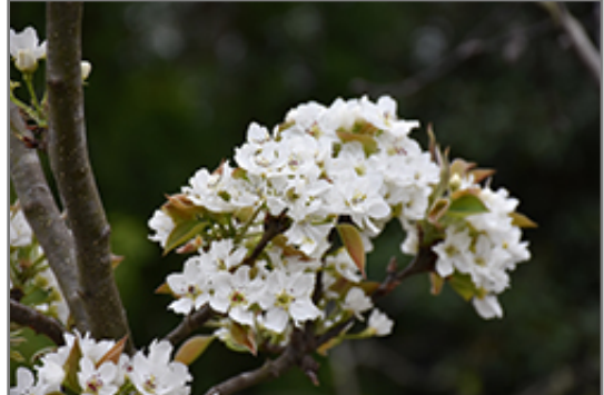
20th Century Pear flowers