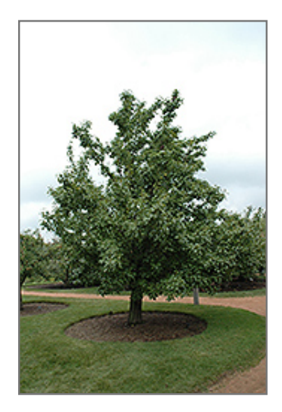
20th Century Pear

20th Century Pear will grow to be about 35 feet tall at maturity, with a spread of 25 feet. It has a low canopy with a typical clearance of 5 feet from the ground, and should not be planted underneath power lines. It grows at a fast rate, and under ideal conditions can be expected to live for 50 years or more. This variety requires a different selection of the same species growing nearby in order to set fruit.