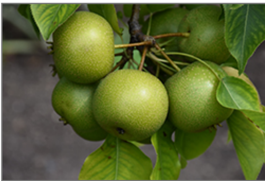
20th Century Pear fruit

20th Century Pear is clothed in stunning clusters of white flowers with purple anthers along the branches in early spring before the leaves. It has dark green deciduous foliage. The glossy pointy leaves turn an outstanding tomato-orange in the fall. The fruits are showy yellow pears with hints of red, which are carried in abundance in late summer. The fruit can be messy if allowed to drop on the lawn or walkways, and may require occasional clean-up.