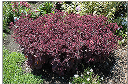
Xenox Stonecrop in bloom