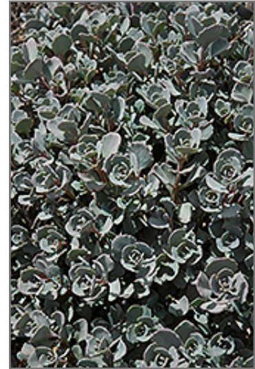
Lidakense Stonecrop foliage

Lidakense Stonecrop is recommended for the following landscape applications;