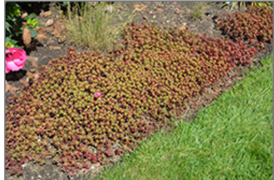
Fulda Glow Stonecrop

Fulda Glow Stonecrop is a fine choice for the garden, but it is also a good selection for planting in outdoor pots and containers. Because of its spreading habit of growth, it is ideally suited for use as a 'spiller' in the 'spiller-thriller-filler' container combination; plant it near the edges where it can spill gracefully over the pot. Note that when growing plants in outdoor containers and baskets, they may require more frequent waterings than they would in the yard or garden.