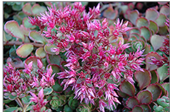
Fulda Glow Stonecrop flowers