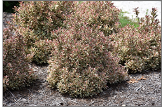
My Monet Weigela

My Monet Weigela makes a fine choice for the outdoor landscape, but it is also well-suited for use in outdoor pots and containers. It is often used as a 'filler' in the 'spiller-thriller-filler' container combination, providing a mass of flowers and foliage against which the thriller plants stand out. Note that when grown in a container, it may not perform exactly as indicated on the tag - this is to be expected. Also note that when growing plants in outdoor containers and baskets, they may require more frequent waterings than they would in the yard or garden.