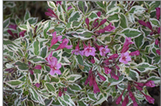
My Monet Weigela flowers

My Monet Weigela is recommended for the following landscape applications;