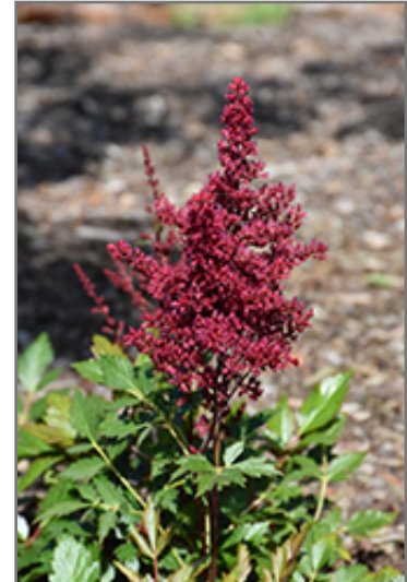
Red Sentinel Astilbe flowers

Red Sentinel Astilbe is a fine choice for the garden, but it is also a good selection for planting in outdoor pots and containers. With its upright habit of growth, it is best suited for use as a 'thriller' in the 'spiller-thriller-filler' container combination; plant it near the center of the pot, surrounded by smaller plants and those that spill over the edges. Note that when growing plants in outdoor containers and baskets, they may require more frequent waterings than they would in the yard or garden.