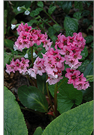
Pink Dragonfly Bergenia flowers

Pink Dragonfly Bergenia is recommended for the following landscape applications;