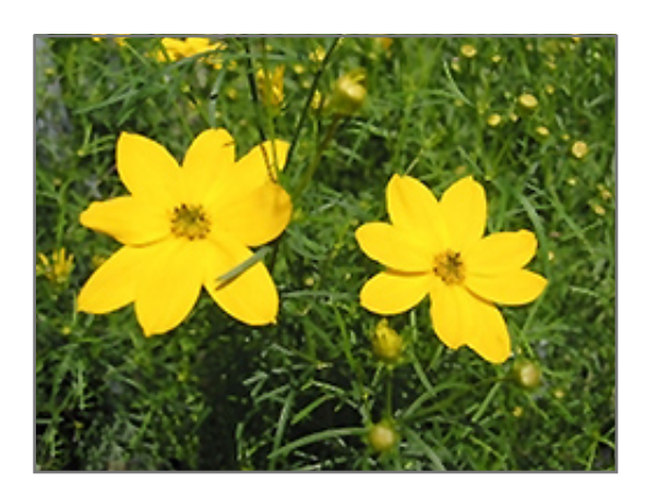
Golden Rain Tickseed flowers