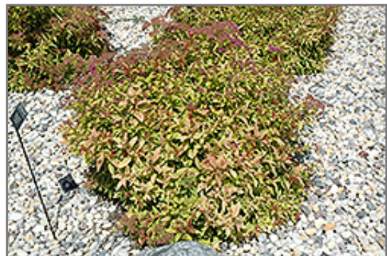
Flaming Mound Spirea