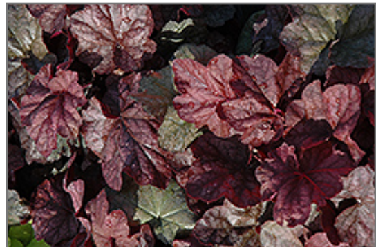
Beaujolaishairy Alumroot foliage