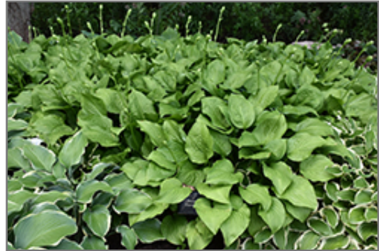
Royal Standard Hosta