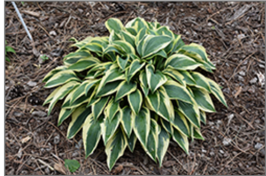
Wolverine Hosta

This plant does best in partial shade to shade. It prefers to grow in average to moist conditions, and shouldn't be allowed to dry out. It is not particular as to soil type or pH. It is somewhat tolerant of urban pollution. This particular variety is an interspecific hybrid. It can be propagated by division; however, as a cultivated variety, be aware that it may be subject to certain restrictions or prohibitions on propagation.