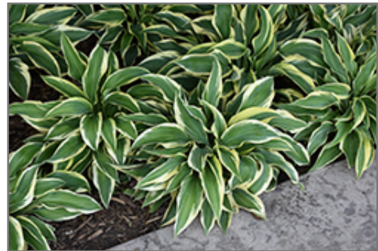
Wolverine Hosta