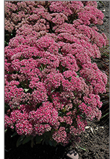
Mr. Goodbud Stonecrop flowers

Mr. Goodbud Stonecrop is recommended for the following landscape applications;