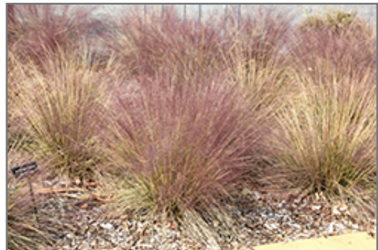
Hairawn Muhly in fall