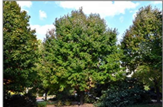
Autumn Flame Red Maple

This tree should only be grown in full sunlight. It is quite adaptable, preferring to grow in average to wet conditions, and will even tolerate some standing water. It is not particular as to soil type, but has a definite preference for acidic soils, and is subject to chlorosis (yellowing) of the foliage in alkaline soils. It is somewhat tolerant of urban pollution. This is a selection of a native North American species.