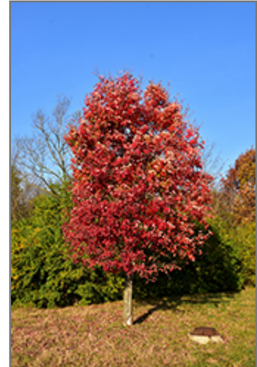
Autumn Flame Red Maple in fall

Autumn Flame Red Maple is recommended for the following landscape applications;