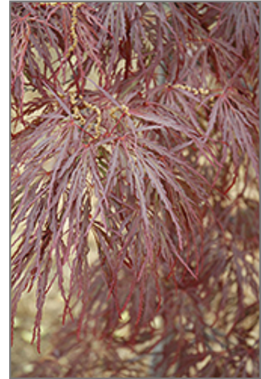
Garnet Cutleaf Japanese Maple foliage

Garnet Cutleaf Japanese Maple is recommended for the following landscape applications;