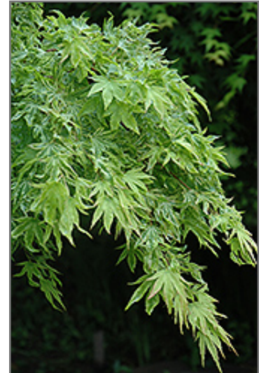
Higasa Yama Japanese Maple foliage

Higasa Yama Japanese Maple is recommended for the following landscape applications;