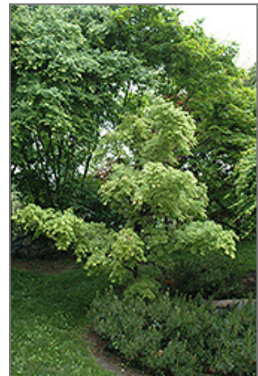
Higasa Yama Japanese Maple