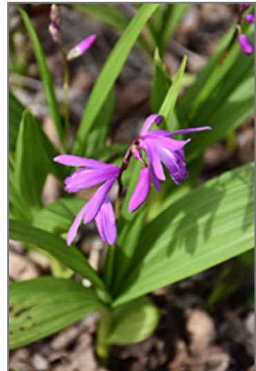
Lavender Japanese Hyacinth Orchid flowers