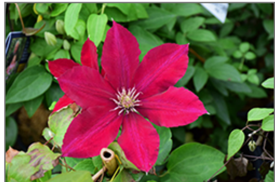
Rebecca Clematis flowers