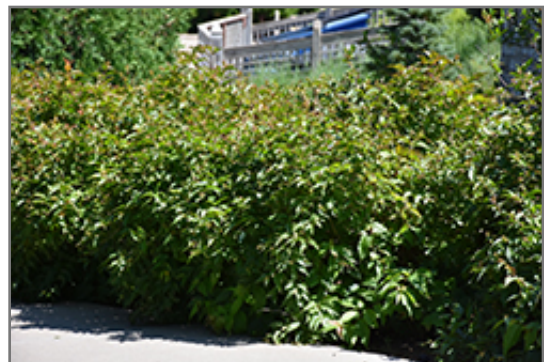
Copper Bush Honeysuckle