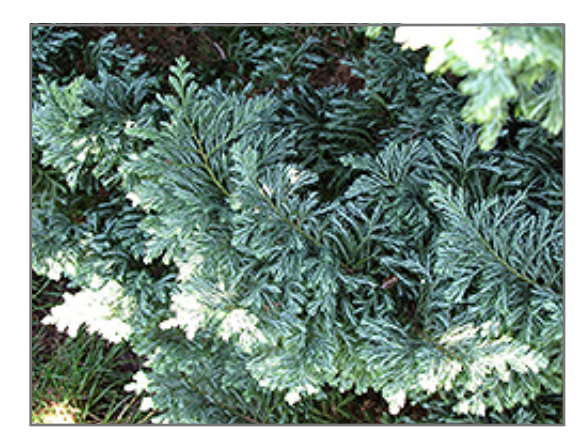
Boulevard Falsecypress foliage