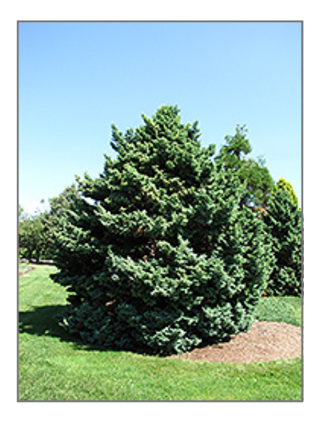
Boulevard Falsecypress