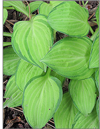
Emerald Tiara Hosta foliage