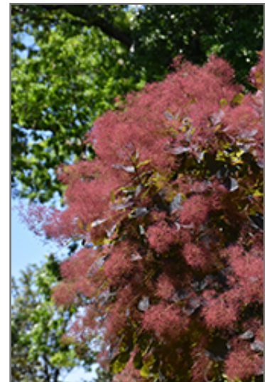
Grace Smokebush flowers