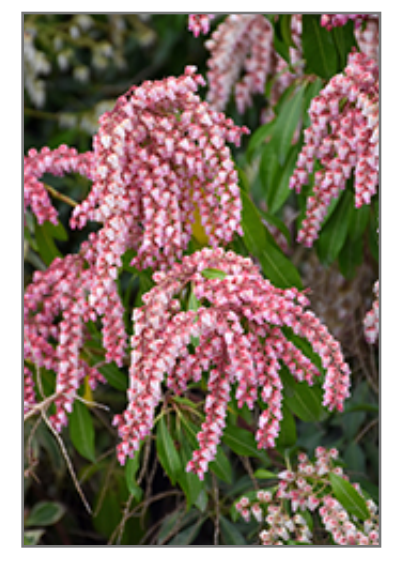
Valley Rose Japanese Pieris flowers