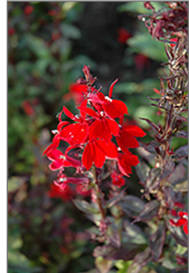
Queen Victoria Lobelia flowers