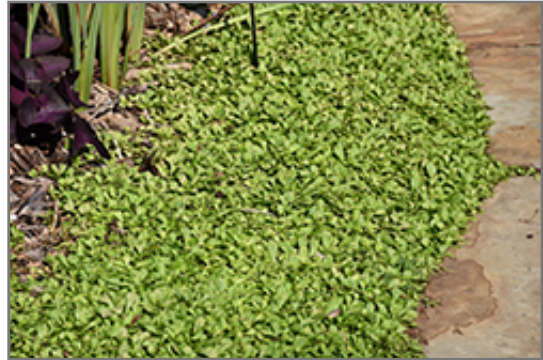
Creeping Mazus

Creeping Mazus is a fine choice for the garden, but it is also a good selection for planting in outdoor pots and containers. Because of its spreading habit of growth, it is ideally suited for use as a 'spiller' in the 'spiller-thriller-filler' container combination; plant it near the edges where it can spill gracefully over the pot. Note that when growing plants in outdoor containers and baskets, they may require more frequent waterings than they would in the yard or garden.