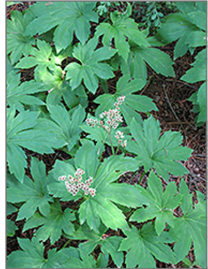
Crimson Fans Mukdenia flowers

Crimson Fans Mukdenia will grow to be about 12 inches tall at maturity extending to 18 inches tall with the flowers, with a spread of 24 inches. When grown in masses or used as a bedding plant, individual plants should be spaced approximately 20 inches apart. Its foliage tends to remain dense right to the ground, not requiring facer plants in front. It grows at a medium rate, and under ideal conditions can be expected to live for approximately 10 years. As an herbaceous perennial, this plant will usually die back to the crown each winter, and will regrow from the base each spring. Be careful not to disturb the crown in late winter when it may not be readily seen!