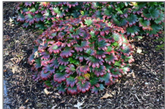
Crimson Fans Mukdenia