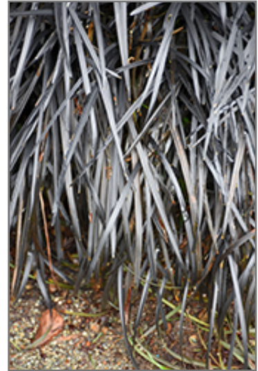
Black Mondo Grass foliage

Black Mondo Grass is a fine choice for the garden, but it is also a good selection for planting in outdoor pots and containers. It is often used as a 'filler' in the 'spiller-thriller-filler' container combination, providing a mass of flowers and foliage against which the thriller plants stand out. Note that when growing plants in outdoor containers and baskets, they may require more frequent waterings than they would in the yard or garden.