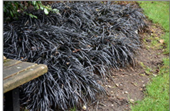
Black Mondo Grass

Black Mondo Grass is recommended for the following landscape applications;