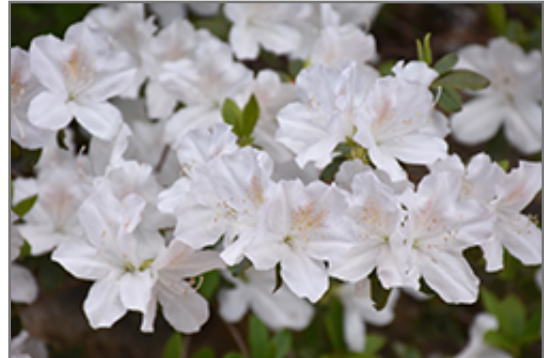
Delaware Valley White Azalea flowers