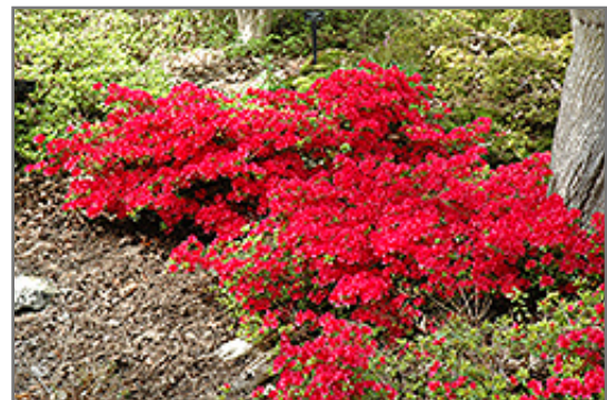
Hino Crimson Azalea in bloom