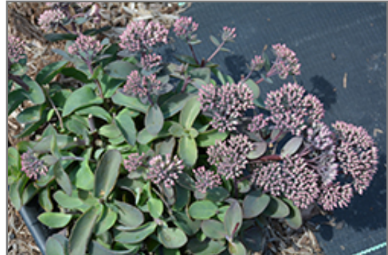
Chocolate Drop Stonecrop flower buds