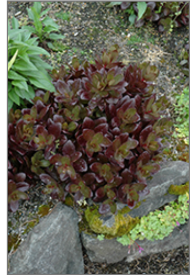
Chocolate Drop Stonecrop

Chocolate Drop Stonecrop is a dense herbaceous perennial with an upright spreading habit of growth. Its relatively coarse texture can be used to stand it apart from other garden plants with finer foliage.