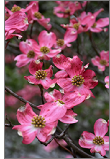
Cherokee Chief Flowering Dogwood flowers

This is a relatively low maintenance tree, and usually looks its best without pruning, although it will tolerate pruning. It is a good choice for attracting birds to your yard. Gardeners should be aware of the following characteristic(s) that may warrant special consideration;