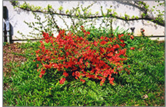
Common Flowering Quince in bloom

Common Flowering Quince is a dense multi-stemmed deciduous shrub with a more or less rounded form. Its average texture blends into the landscape, but can be balanced by one or two finer or coarser trees or shrubs for an effective composition.