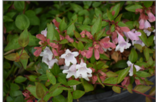
Edward Goucher Abelia flowers

This shrub will require occasional maintenance and upkeep, and should only be pruned after flowering to avoid removing any of the current season's flowers. It is a good choice for attracting birds, bees and butterflies to your yard, but is not particularly attractive to deer who tend to leave it alone in favor of tastier treats. It has no significant negative characteristics.