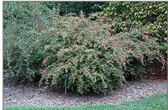
Edward Goucher Abelia in bloom