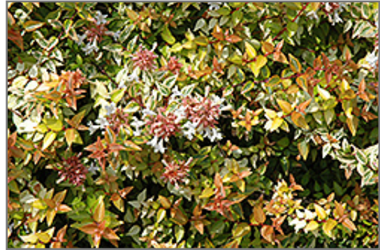
Kaleidoscope Abelia flowers

This shrub will require occasional maintenance and upkeep, and should only be pruned after flowering to avoid removing any of the current season's flowers. It is a good choice for attracting birds, bees and butterflies to your yard, but is not particularly attractive to deer who tend to leave it alone in favor of tastier treats. It has no significant negative characteristics.