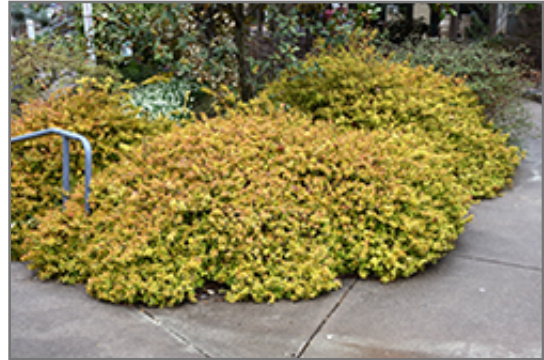
Kaleidoscope Abelia

Kaleidoscope Abelia will grow to be about 30 inches tall at maturity, with a spread of 4 feet. It tends to fill out right to the ground and therefore doesn't necessarily require facer plants in front. It grows at a slow rate, and under ideal conditions can be expected to live for approximately 30 years.