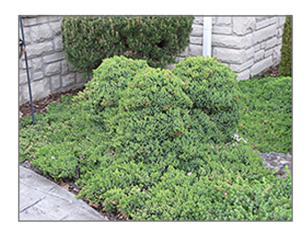
Dwarf Japanese Garden Juniper

Dwarf Japanese Garden Juniper is a dense multi-stemmed evergreen shrub with a ground-hugging habit of growth. It lends an extremely fine and delicate texture to the landscape composition which should be used to full effect.