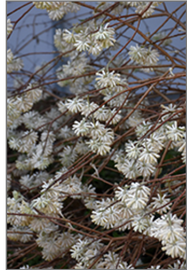
Oriental Paper Bush flowers