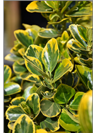
Gold Variegated Japanese Euonymus foliage

Gold Variegated Japanese Euonymus is recommended for the following landscape applications;