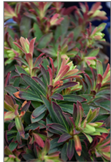
Tiny Tim Spurge flowers