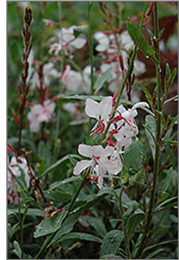
Ballerina Blush Gaura flowers

This is a relatively low maintenance plant, and is best cleaned up in early spring before it resumes active growth for the season. It is a good choice for attracting butterflies to your yard, but is not particularly attractive to deer who tend to leave it alone in favor of tastier treats. It has no significant negative characteristics.