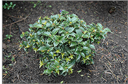
Rock Garden Holly

Rock Garden Holly is recommended for the following landscape applications;