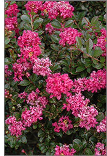
Pocomoke Crapemyrtle flowers

Pocomoke Crapemyrtle is recommended for the following landscape applications;