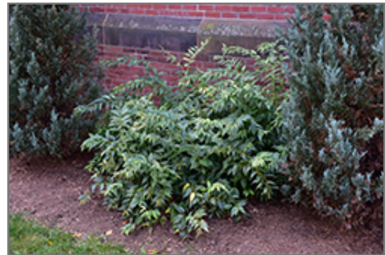
Rainbow Fetterbush