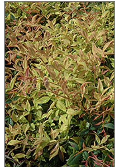
Gulf Stream Dwarf Nandina foliage