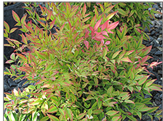
Moon Bay Dwarf Nandina