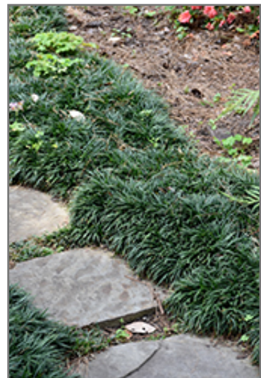
Dwarf Mondo Grass