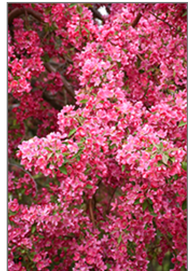
Prairifire Flowering Crab flowers