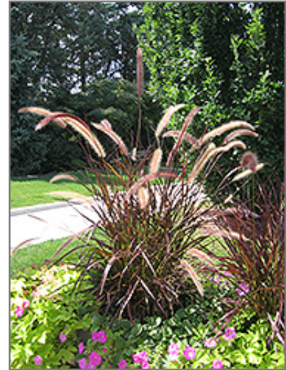
Purple Fountain Grass flowers

Purple Fountain Grass is recommended for the following landscape applications;