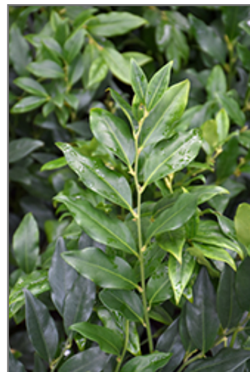
Fragrant Sweet Box foliage