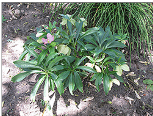
Winter Jewels Cherry Blossom Hellebore in bloom